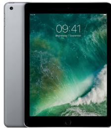
Apple iPad 9.7" 32GB