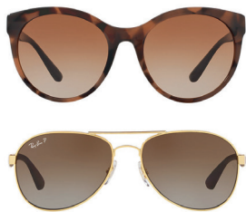
Burberry Ladies Sunglasses Ray-Ban Mens Sunglasses