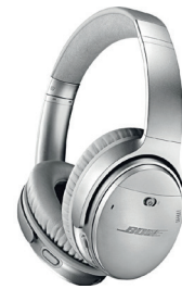
BOSE QuietComfort QC35 II Wireless Bluetooth Noise-Cancelling Headphones - Silver